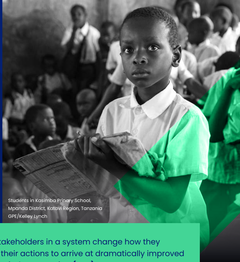
Students in Kasimba Primary School, Mpanda District, Katavi Region, Tanzania

Education transformation comes about when stakeholders in a system change how they interact with one another, purposefully aligning their actions to arrive at dramatically improved outcomes. Toward this goal, the Global Partnership for Education (GPE) supports partner countries in getting the most out of policy dialogue and coordination. This brief is part of a companion series to the Principles toward Effective Local Education Groups , although the contents can apply to any mechanism or platform where stakeholders gather to coordinate their actions around national education policy.