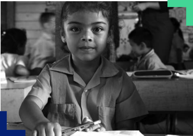
A young girl in class at the Tim Hines school in Tegucigalpa, Honduras.

objectives, understanding their needs, and more effectively anticipating and addressing resistance. When stakeholders perceive that their interests and perspectives are understood and valued, they in turn are more likely to participate actively, contribute ideas and support the transformation process. Effective communication thus builds trust and agency, fostering a sense of ownership and commitment to the transformation process among stakeholders.