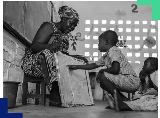
A teacher and her students in class at the community preschool in Nambirghékaha, near Korhogo, Côte d'Ivoire.